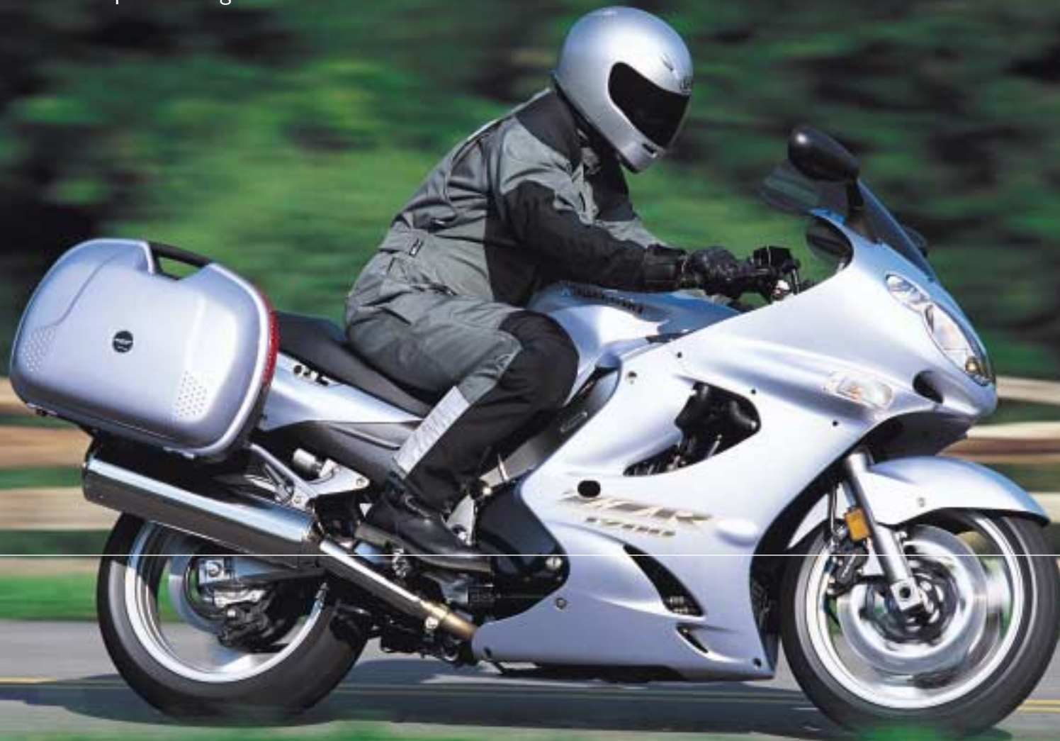
ZZR1200 Shown with available accessories.

The ZZR® 1200 is the Stealth Bomber of the Kawasaki sport touring line. Because behind the sleek, aerodynamic bodywork lies our most powerful sport-touring engine to date. The ZZR1200 moves down the road with absolute authority thanks to its 1,164cc DOHC In-Line Four engine and with utmost stability from its aluminum perimeter frame and remotely adjustable spring preload. Stealth touring at its best, you might call it. • Choose the ZZR600 for surprising performance in a lighter, easier handling (and more affordable) 599cc format. Featuring Twin Ram Air and a powerful DOHC In-Line Four engine, the ZZR600 envelopes you in high performance while spoiling you with comfortable seating and wind protection. 4-piston front brake calipers further expand its high-performance envelope. • The Concours™ is Kawasaki's best-loved sport-touring bike. With its 997cc 4-cylinder engine, roomy ergonomics, and generous 7.5-gallon fuel tank, the Concours is a popular platform for sport-touring adventure.